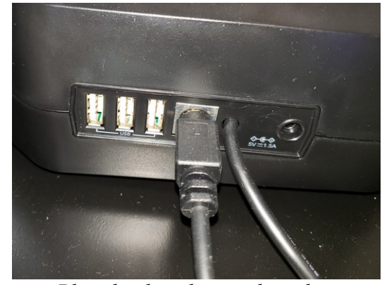
Plug the throttle into the yoke.