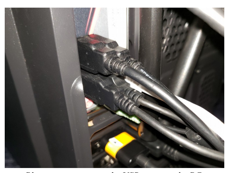
Plug accessories into the USB ports on the PC.

Logitech Accesories - Switch Panel, Radio Panel, Autopilot, Flight Instrument Multi Panel If you ordered any of these optional accessories, they will plug into an available USB port. If you install additional accessories, there may not be enough ports or power available. We recommend using a powered 4 amp USB hub. It can be 2.0 or 3.0, such as this one: <a href="https://www.amazon.com/AmazonBasics-Port-USB-Power-Adapter/dp/B00DQFGJR4/">https://www.amazon.com/AmazonBasics-Port-USB-Power-Adapter/dp/B00DQFGJR4/</a>