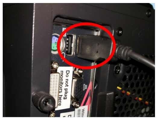
Plug the yoke and rudder pedals into an available USB port.