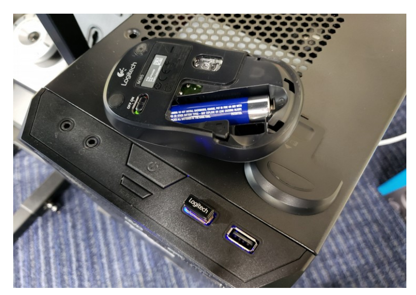
The USB receiver may be inside the mouse.

Keyboard/Mouse – The wireless keyboard and mouse have a receiver that comes in the box. There is a slot inside the mouse to hold the receiver. We suggest plugging the receiver into one of the front USB ports so that it is as close as possible to the mouse and keyboard to avoid interference. Any USB port on the PC can be used; however, if you have trouble with mouse tracking, avoid putting something into the USB port immediately adjacent to the one the receiver is in.