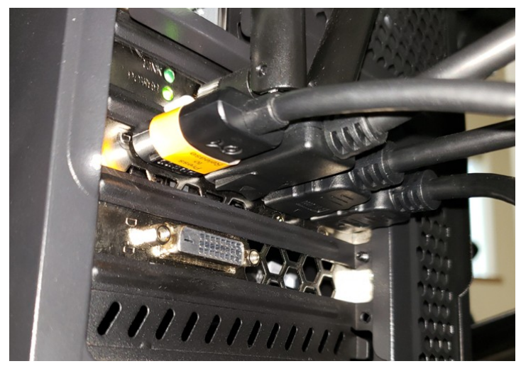
Monitors plug into the HDMI and Display Ports. (4 shown)