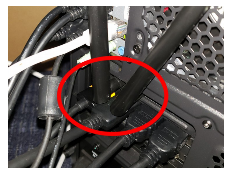
Antenna ports are located above the video card.

Antennas – Make sure you install the antennas in the back of the computer. They screw in.